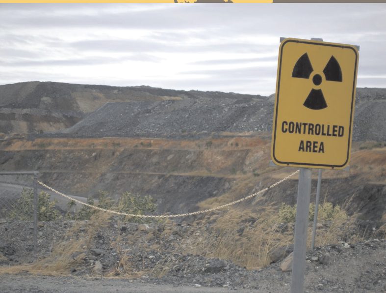
Ranger Uranium Mine in Australia

The nuclear industry have started using the climate crisis as their Number One argument. We want to show these lies for what they are: The climate crisis means that all fossil fuels and uranium will make things dramatically worse, not better!