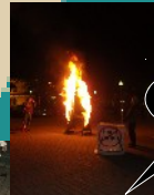
Uranium Action Day, Loviisa (FIN), September 2008