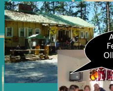
Anti Nuclear Festival, near Oikiluoto (FIN), June 2008