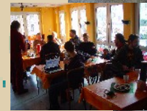
Network Meeting, Frankfurt/Main (D), Dec. 2008/jan. 2009