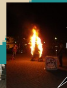
Uranium Action Day, Loviisa (FIN), September 2008