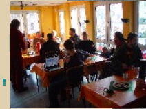
Network Meeting, Frankfurt/Main (D), Dec. 2008/jan. 2009