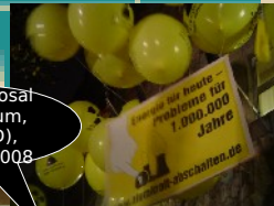
Final Disposal Symposium, Berlin (D), October 2008