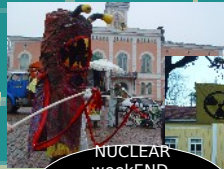
NUCLEAR weekEND, Isnäs/Loviisa (FIN), October 2008